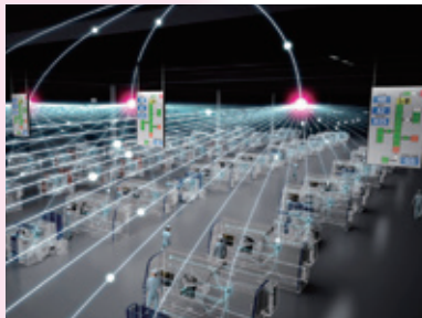
IoE (Internet of Everything)