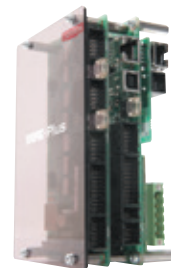
Safety PLC (Programmable Logic Controller)