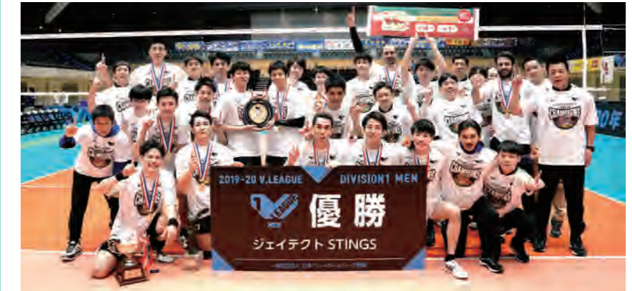
JTEKT STINGS won their first league championship in their seventh year of promotion to the top league

Through sports, JTEKT will contribute to the development of young people and the promotion of sports, and by expanding the scope of activities of JTEKT STINGS, which has become No. 1 in Japan, we will strive to improve the company's recognition and favorable impression.