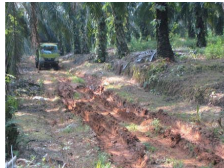
Example of muddy road