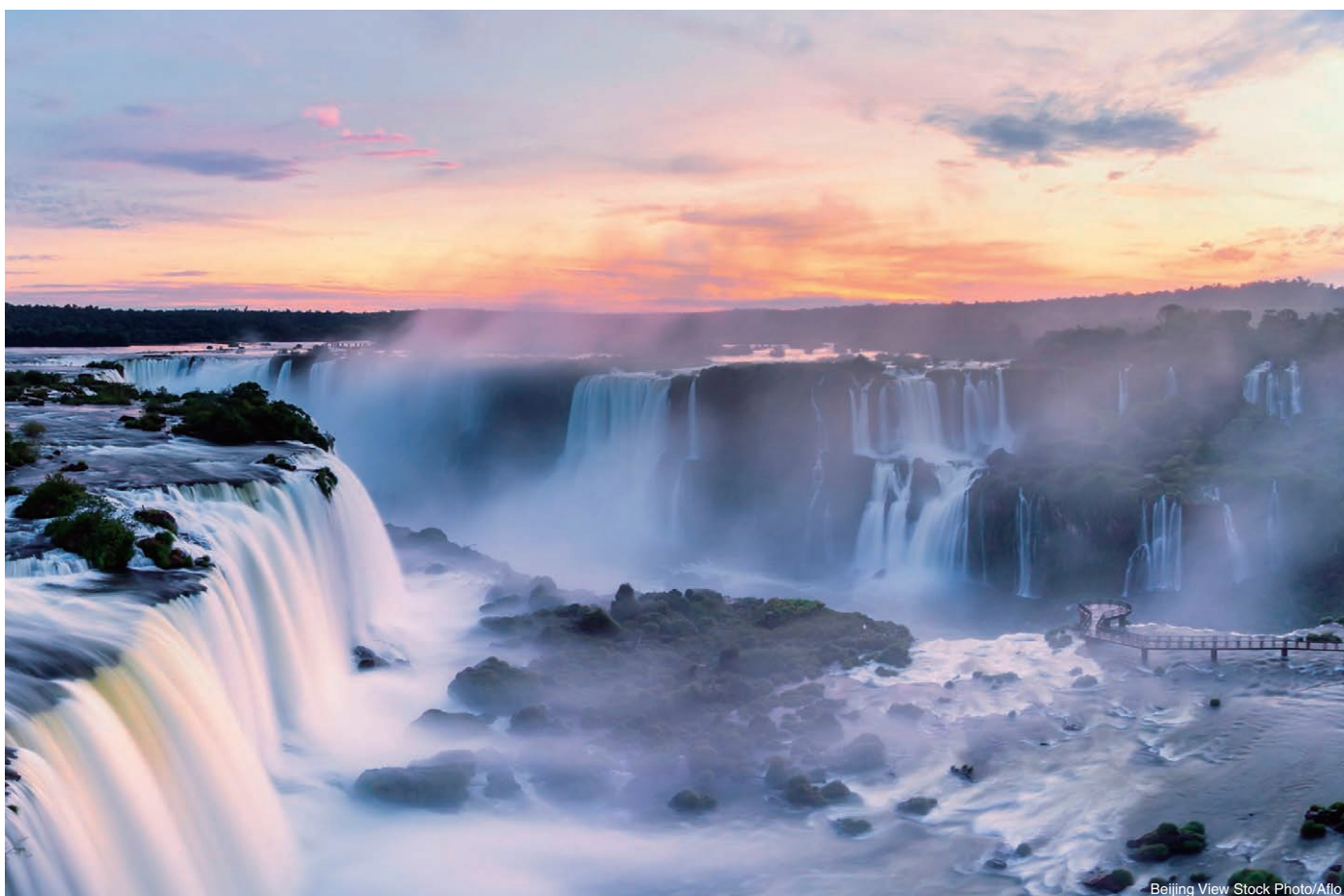
Beijing View

Special Edition on Automotive Technologies